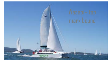
Wasabi- top mark bound

PH: (61) 02 4962 4288 F: (61) 02 4962 4122 Email: info@schionningdesigns.com.au