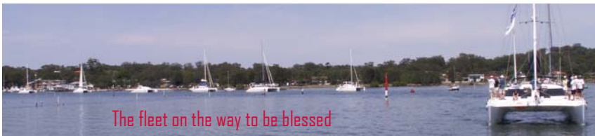
The fleet on the way to be blessed