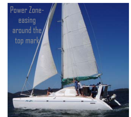
Power Zone- easing around the top mark