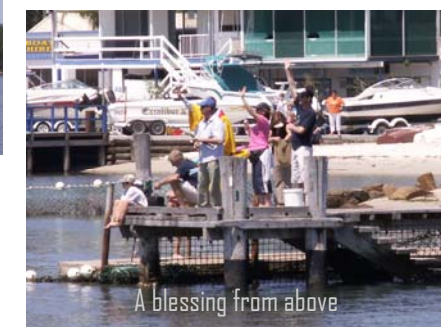
A blessing from above