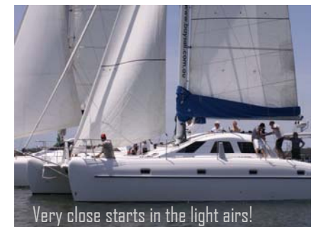
Very close starts in the light airs!